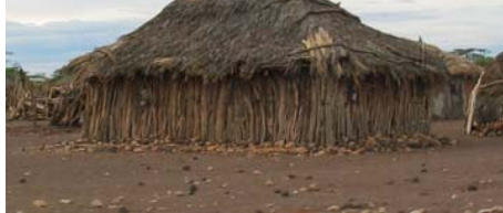
Gabra House that we saw in Kalacha.